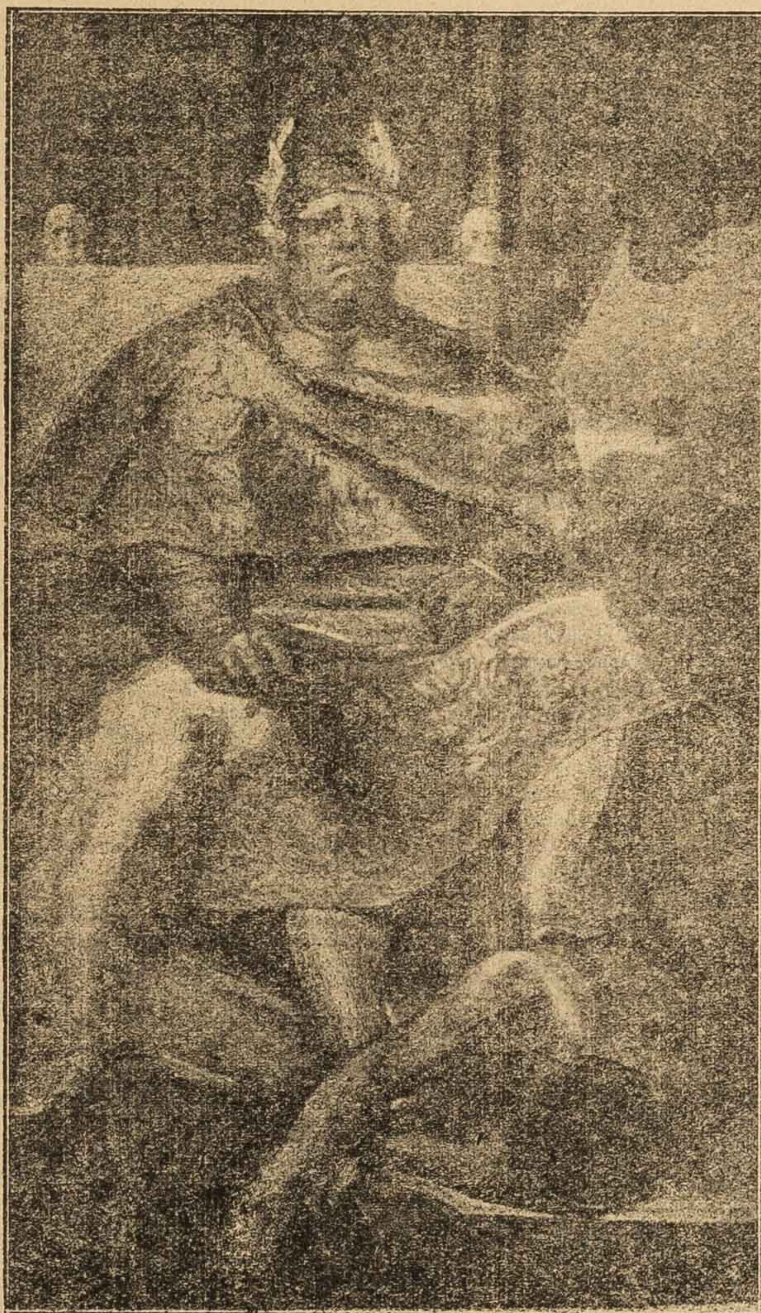
MAMMON.—G. F. Watts.

"Men of Durham, remember the noble struggle of your fathers of old!" says the Morrison Lodge; and well it may, seeing that the